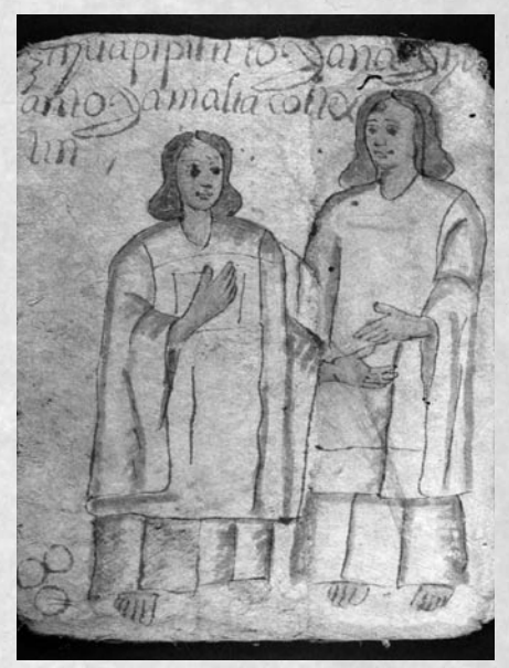
Kislak Techialoyan manuscript.

The gender content of the Kislak Techialoyan manuscripts feeds into the "Gender in Early Mesoamerica" online searchable database that WHP is constructing. The manuscripts will be indexed in the WHP online portal site ("Virtual Mesoamerican Archive"), whp.uoregon.edu/projects. html.