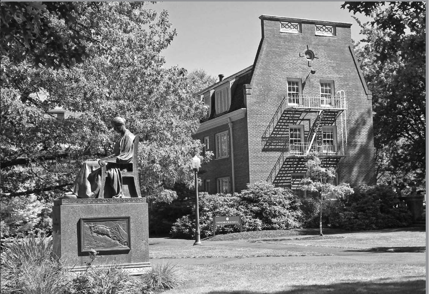
HENDRICKS HALL—HOME OF THE CENTER FOR THE STUDY OF WOMEN IN SOCIETY

PLANTING THE SEEDS OF EXCELLENCE: CSWS TOPS $2 MILLION IN GRANT AWARDS