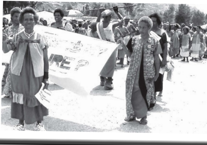
Left: Figure 1: Porgera women demonstrate against the proposed closing of the Porgera Hospital, carrying a sign saying “Where is my future?” / photo by Aletta Biersack.

The research confirms what my early twenty-first century research suggested: that this reproductive regime is in trouble. Mining has transformed a “gift economy” in which relatives by birth and by marriage shared wealth, confirming their commitments to one another, into a money- and market-based economy in which erstwhile gifts are now commodified