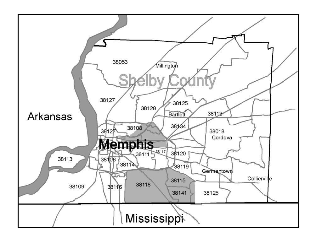
Figure 3: Location of Latino Communities in Memphis and Shelby County.

Research by CROW on the commercial advertisements of three weekly Spanish-language newspapers published in Memphis found that four bus companies are now providing daily or weekly transportation from Memphis to different locations in Mexico. Only one such company was doing business locally in 1995. In the fall of 2000, CROW researchers counted twenty-six businesses catering to Latino immigrants in the Parkway Village, Fox Meadows, and Southeast Memphis area. These included restaurants, bars, supermarkets, video-rental stores, churches, a bakery, a disco, a radio station, and a short-lived movie-theater with Spanish subtitles.