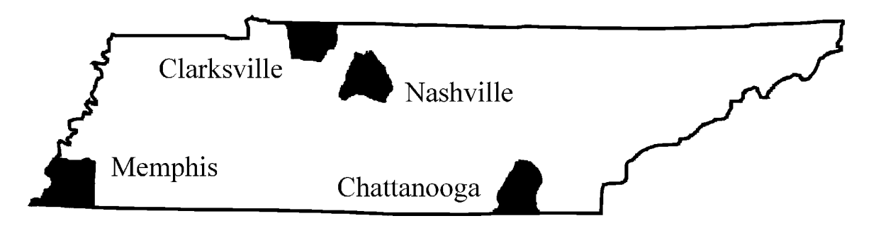
Figure 2: Tennessee Metropolitan Areas with Significant Latino Immigration

Ten years ago (in 1990), the largest number of Latinos in the state of Tennessee was concentrated in the Nashville-Davidson metropolitan area. One in three Latinos in the state lived in Nashville-Davidson County or in the counties bordering this area. Three other metropolitan areas of Tennessee had also received significant Latino immigration: Memphis, Clarksville, and Chattanooga (see Figure 2, below). Since then, there has been growth of the Latino population in cities across the state. For example, according to the Nashville Chamber of Commerce, the current population estimate in Davidson County is 45,550 Hispanics—as compared with about 8,000 in 1990. In addition, certain rural areas, such as the counties surrounding Morristown in east Tennessee, have drawn an increasing population of Latinos. Even though their numbers may not be large, the presence of Latinos in such relatively sparsely populated rural areas is especially noticeable.